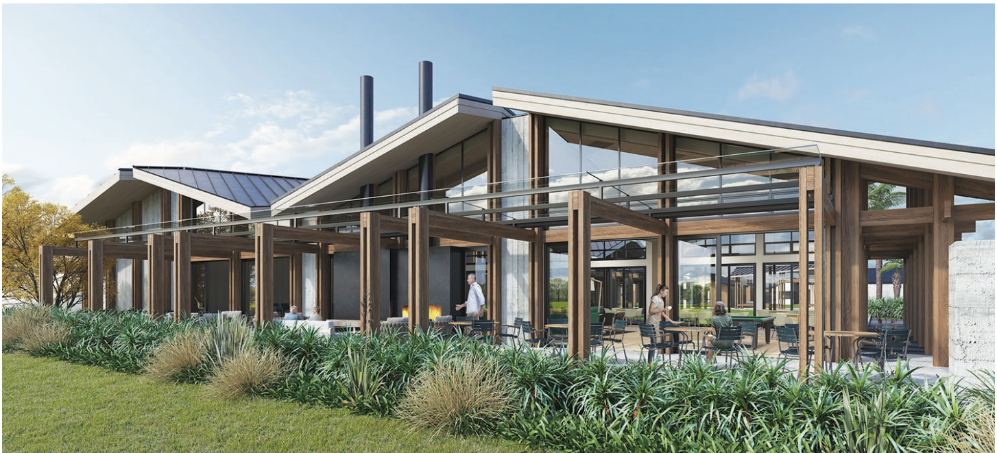
The Botanic offers a pool, cafe, restaurant, snooker, table tennis and both indoor and outdoor bowls.