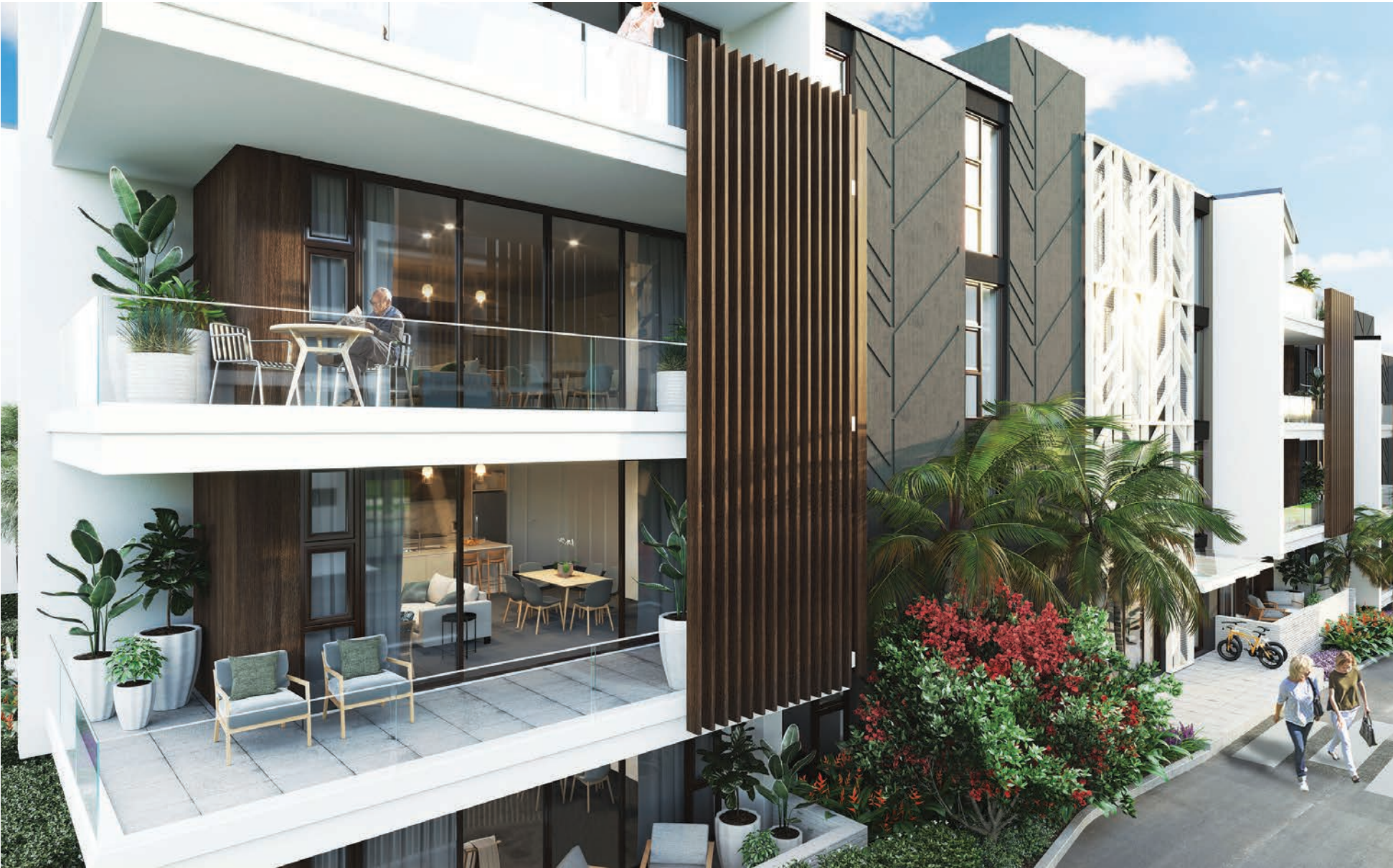
The apartments on offer include one-bedroom at 65sqm, two-bedroom and two-bedroom-plus-study ranging from 80-95sqm and three-bedroom at approximately 106sqm.